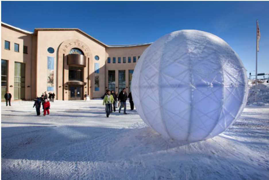
Jäähahtuva -work of art public release