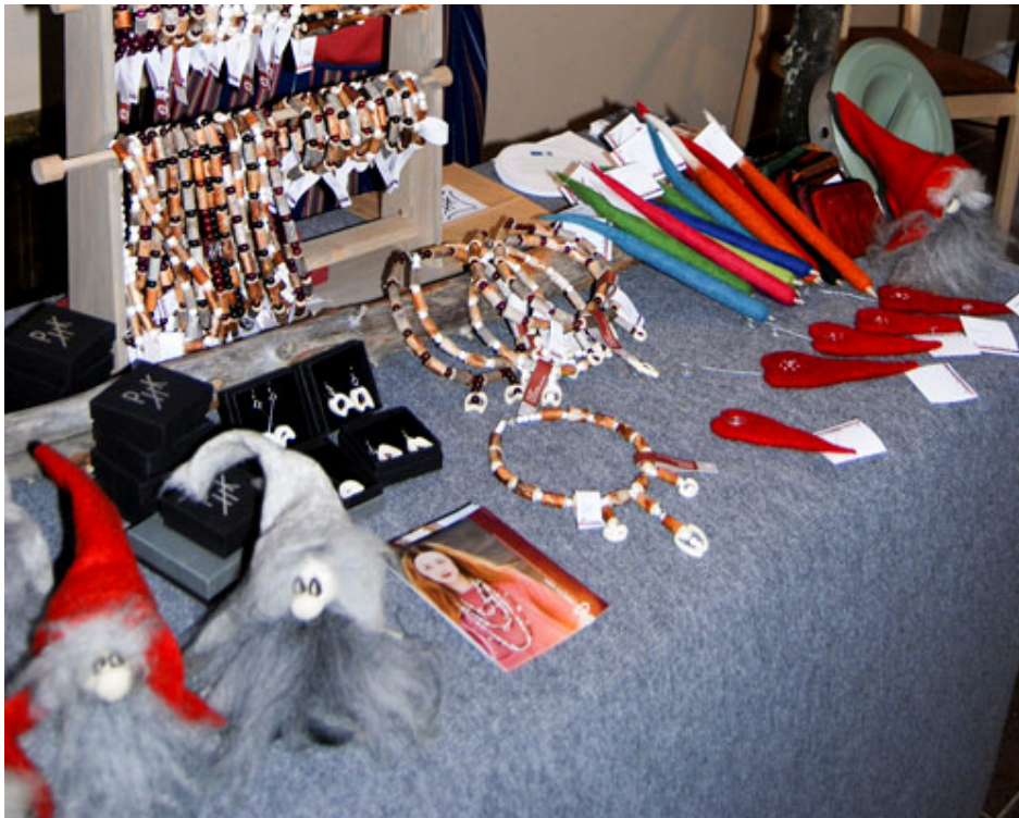
First ARCTIC Market Days

ARKTIS public lecture: Arktikumin kirjasto tutuksi Mistä löydän arktisen tiedon?, Arktisen tiedeviestinnän henkilöstö